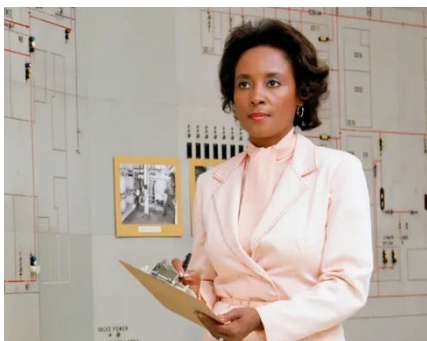
Annie Jean Easley (April 23, 1933 – June 25, 2011) was an American computer scientist, mathematician, and rocket scientist.